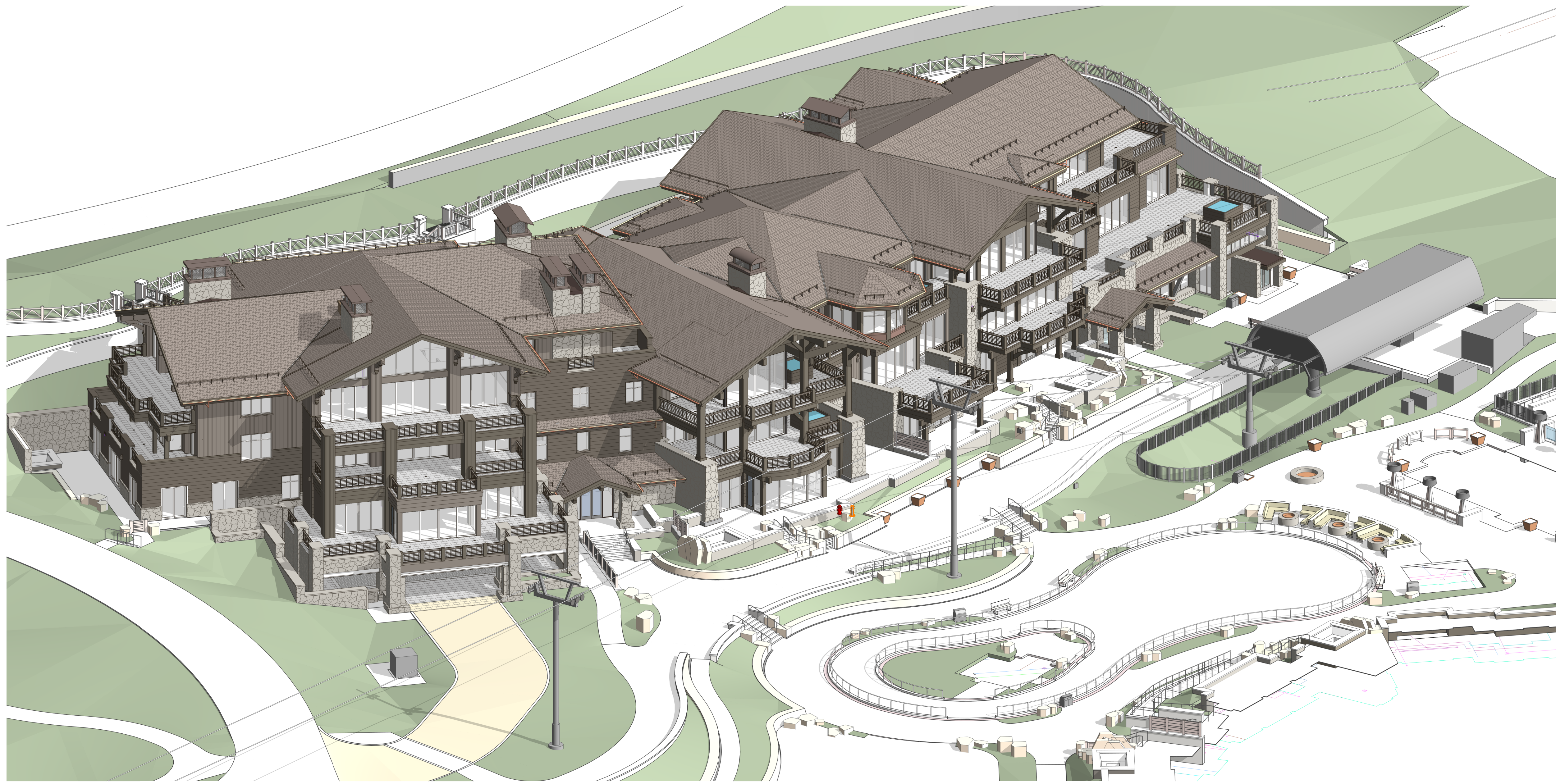
B 3D VIEW B