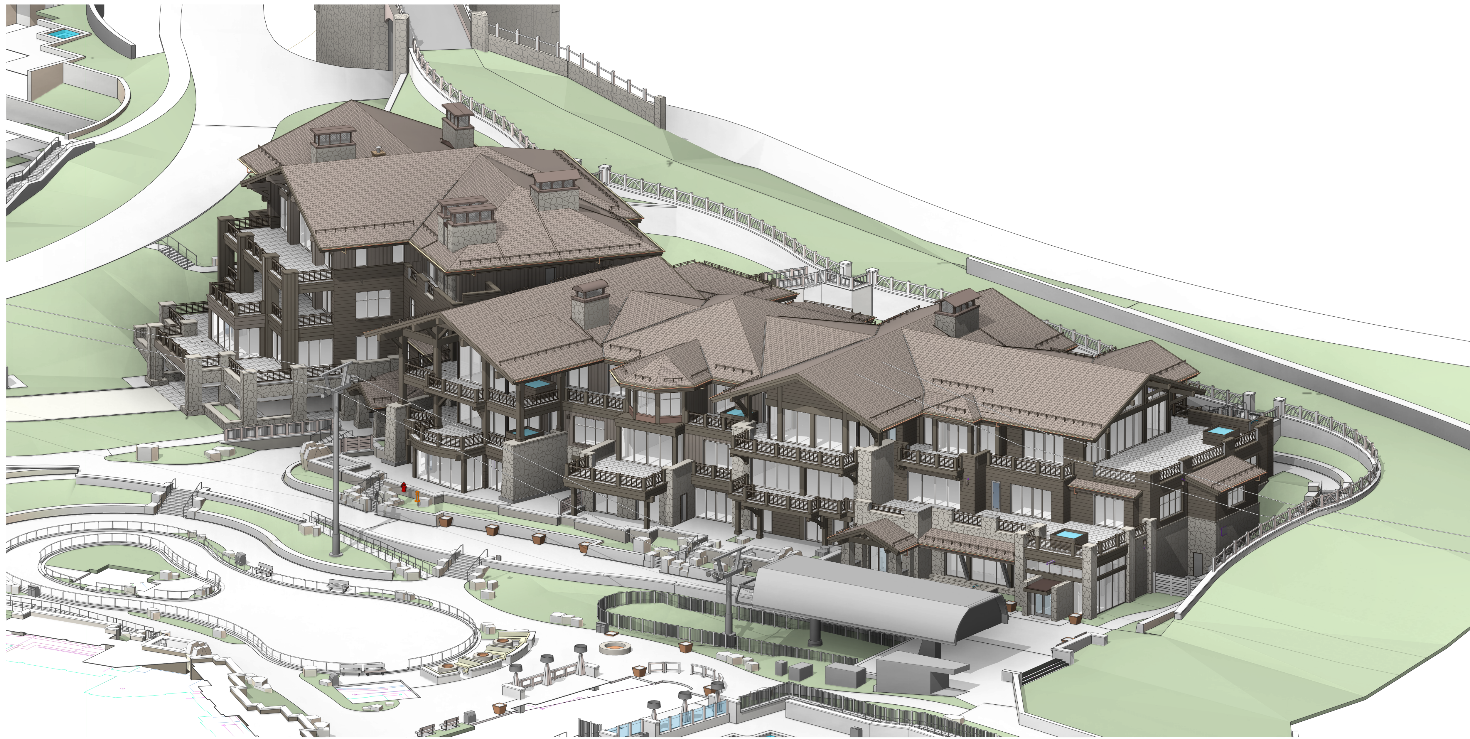
A 3D VIEW A